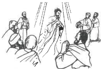
While he was blessing them, he withdrew from them and was carried up into heaven. LUKE 24:51