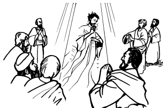
While he was blessing them, he withdrew from them and was carried up into heaven. LUKE 24:51