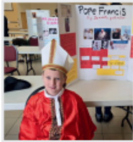
4 th Grade students as their "influential person".