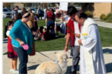
Annual Blessing of the Pets on the Feast of St. Francis.