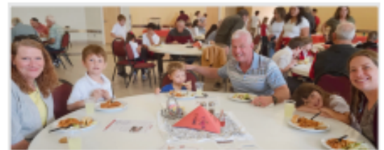
Families enjoyed our spaghetti feast Grandparent's Luncheon!