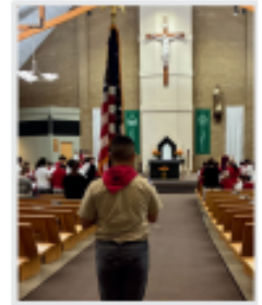
Veteran's Day Service.