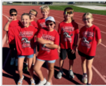
Fun Run success enjoyed by some student runners.