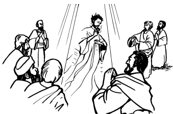
While he was blessing them, he withdrew from them and was carried up into heaven. LUKE 24:51