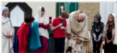
3rd Grade students helping to host All Saints Day Mass, dressed as their favorite Saint.