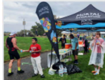
Students volunteering at IRONMAN community event.