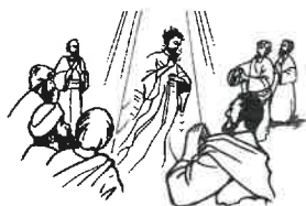
While he was blessing them, he withdrew from them and was carried up into heaven. LUKE 24:51