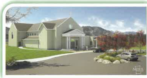
An architect's rendering showed the completed church.

The newly constructed, neoclassical-style church is in a cruciform (cross) shape with four white columns in front, supporting a façade with the message “Domus Dei Et Porta Coeli” (House of God and Gate of Heaven),