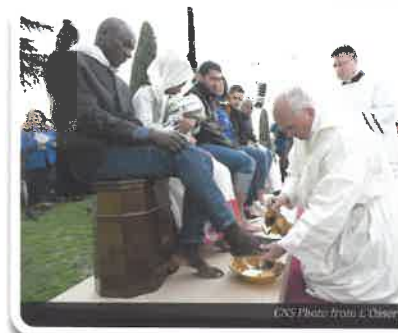
The Pontiff washed the feet of migrants on Holy Thursday in remembrance of Jesus washing His disciples' feet.