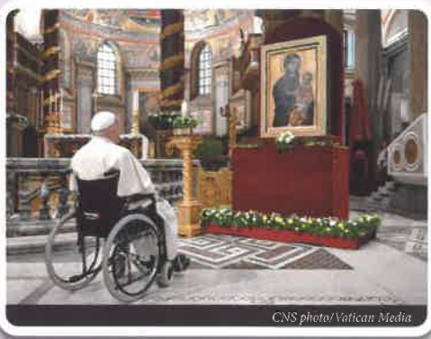
Pope Francis showed his devotion for Blessed Mother in Rome's Basilica of St. Mary Major.