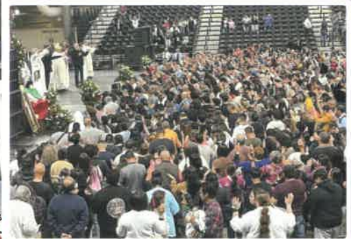
The Catholic Family Evangelization Congress at the Yakima SunDome drew as many as 4,000 people for a single event such as Adoration of the Blessed Sacrament on Saturday, April 26.