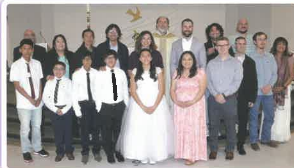
The Parish of the Holy Spirit, Kennewick, welcomed neophytes at their Easter Vigil.