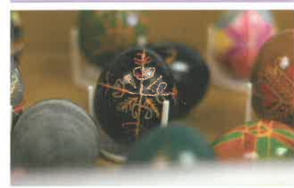
"Pysanky" eggs, decorated in the Ukrainian tradition by Christ the King fifth graders, were given to new Catholics at the Easter Vigil.