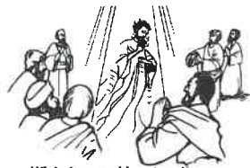
While he was blessing them, he withdrew from them and was carried up into heaven. LUKE 24:51