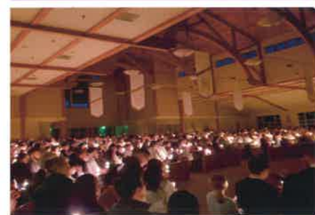
Flames glowed throughout St. Joseph Church, Wenatchee, for the Easter Vigil.