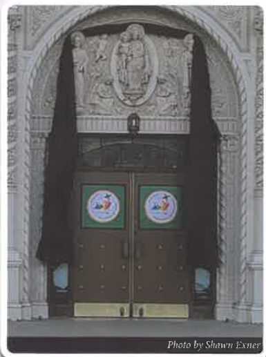
The main doors of St. Paul Cathedral in Yakima were draped in black crepe to honor the Pope.