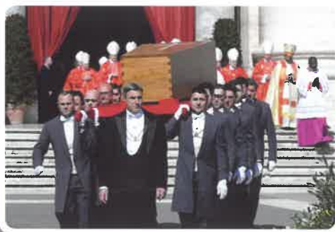
Pall bearers carried the simple casket of the Pope on the day of his funeral.