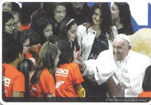
Pope Francis loved children and is shown here blessing young students.