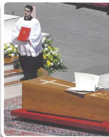
The Book of Gospels atop Pope Francis' casket fluttered open during his funeral.