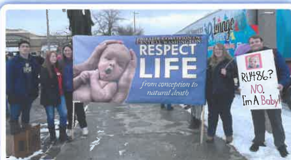
Members of the Gregory Sherman Chapter of Students for Life joined in Yakima's January 2024 Walk for Life.

Check your local church bulletin and the website of the Diocese of Yakima ( yakimadiocese.org ) for announcements of other events in your community.