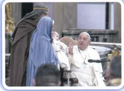
Pope Francis interacts with the people playing Mary, Jesus and Joseph in a living Nativity scene at Rome's Basilica of St. Mary Major Dec. 14, 2024.

PAPAL VISIT (CNS) – Pope Francis made his customary visit to the Basilica of St. Mary Major in Rome to pray before his trip to the island of Corsica. Pope Francis also met with dozens of people, including a living Nativity scene.