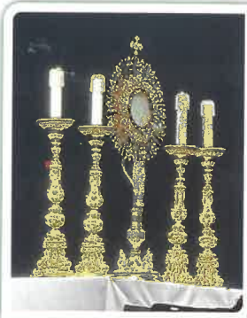
The Eucharist was the centerpiece of each aspect of the Congress.