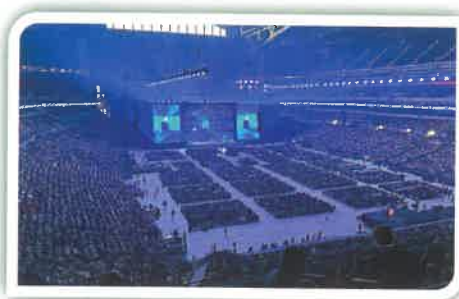
Each day, there was a different color theme at the Eucharistic Congress.