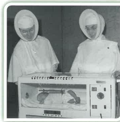
Catholic sisters enjoyed checking on a little one in their care.

In December, 1998, Catholic Charities established what is now called Catholic Charities Housing Services, offering affordable housing and homeownership solutions throughout Central Washington. Today, Catholic Charities Housing Services has helped nearly 1,100 families find a place to call home, with 30 multi-family housing properties serving farmworkers, seniors, the disabled, and those at risk for homelessness. In addition, 236 families have taken a path out of poverty