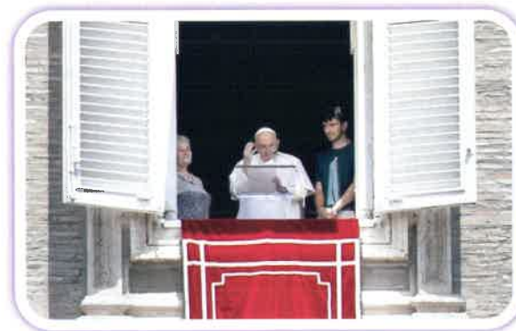
Pope Francis spoke to the crowd, flanked by a grandmother and her grandson.

Pope Francis identified the decline of communal structures in society and the widespread celebration of individualism as other factors behind the isolation of