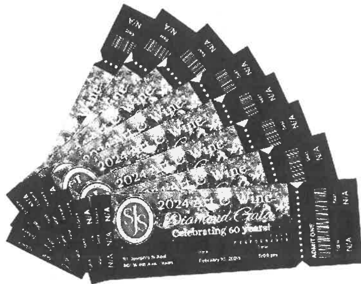
Table of (8) Tickets $576 (10% off)