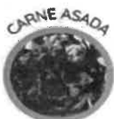
$15.00 PLATE INCLUDES RICE, BEANS, & DRINK