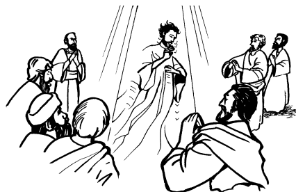
While he was blessing them, he withdrew from them and was carried up into heaven. LUKE 24:51