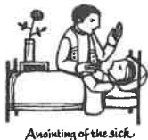
Anointing of the sick.