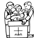
I baptize you in the name of the Father and of the Son and of the Holy Spirit

Saturday, November 16, and Sunday, November 17